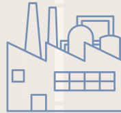
Industrial Licenses for establishing industrial or manufacturing activity