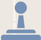
Professional Licenses covering professions, services, craftsmen & artisans