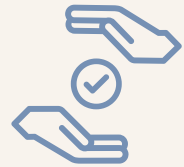
Trading activities commercial licenses

دعم العملاء على مجموعة متنوعة من التحديات التجارية المعقدة التي تنطوي على اللوائح والموافقة من الحكومة. قمنا بإعداد شركتك بشكل صحيح وفي الموعد المحدد لضمان نجاح دخول السوق.